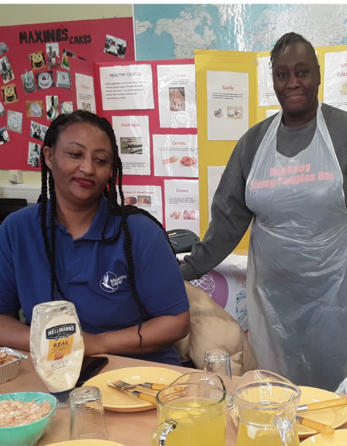
Some of the community groups we have funded - clockwise from top left: WHEAT Mentor Support Trust, Skillspool Training CIC, Turkish Cypriot Cultural Association, Hackney Young People's University, Gascoyne 1 Community Centre.